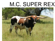
M.C. SUPER REX