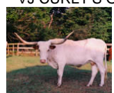
VJ CURLY'S GIRL