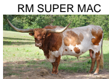
RM SUPER MAC