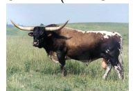
VJ TOMMIE (AKA UNLIMITED)