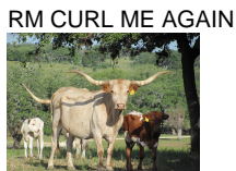
RM CURL ME AGAIN